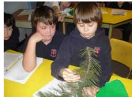
Grade 5 students learn about the Lodgepole pine tree.