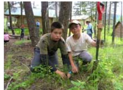
Students from Kamloops district schools are again taking part in tree planting activities at McQueen Lake this year.

Consultants, BCTS, MOF, Natural Resource Science Students, and the public (my mother), all of which are willing to give of their time. The volunteers get the 10-minute tour and lesson of the van, then share their