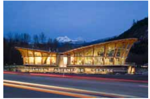
Winner of the Recreational Design Award at the Gala- the Squamish Adventure Center.

Wood WORKS! BC — an initiative of the Canadian Wood Council, whose mandate is to promote the use of wood and wood products in non-residential construction, held their second annual awards event in March at the Four Seasons Hotel in Vancouver.