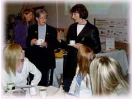
Speakers and participants at the Women in Resource Communities Conference.