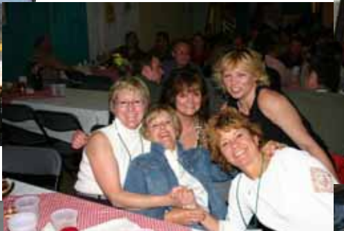
The 'girls' have fun