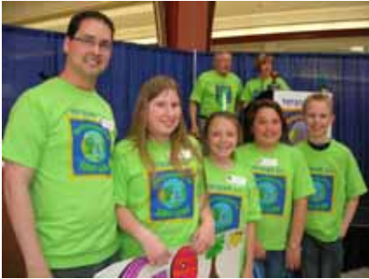
One of the winning teams in the Central Okanagan for 2006.

middle school teams squared off to compete in the Terasen Gas Environmental Mind Grind Challenge with hundreds of parents, friends and fellow students cheering them on.