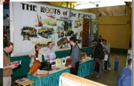
Forest Education Van