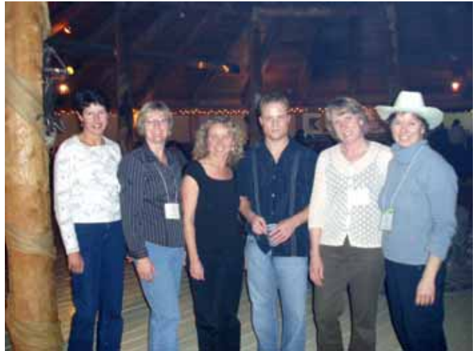
Southern Interior forest educators at Jan. 2006 ForestEDWest II in Banff