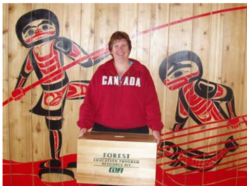
A teacher receiving a grade 5 teaching kit in Moricetown, BC