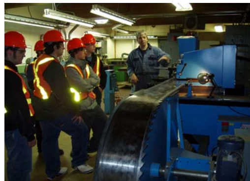
Student participation in Project Manufacturing at Canfor's Mackenzie mill in Mackenzie