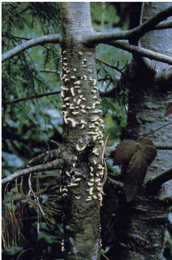
White Pine with fungal structures containing spores